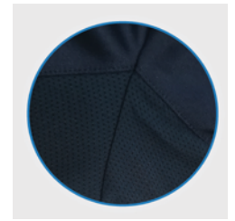
Mesh panel on side & underarms